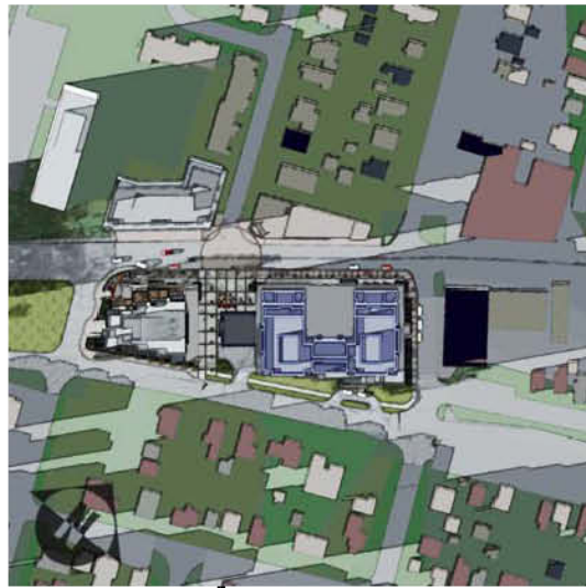
DECEMBER 21 3 PM