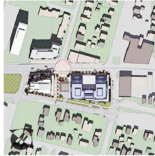
JUNE 21 NOON