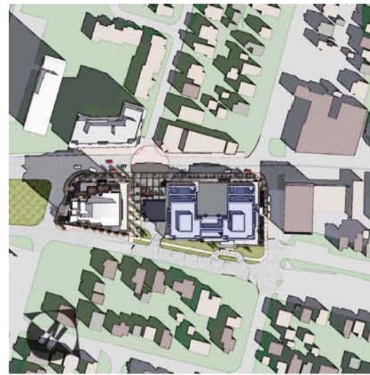
JUNE 21 9 AM