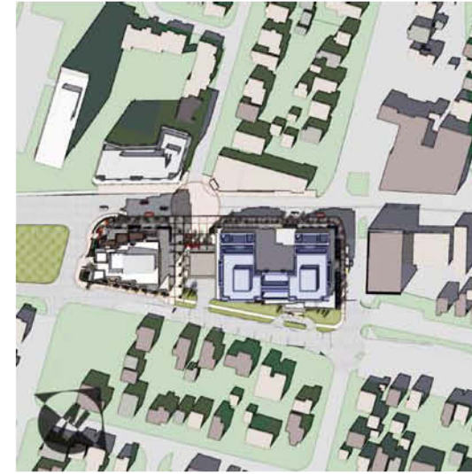
MARCH 21 SEPTEMBER 21 NOON