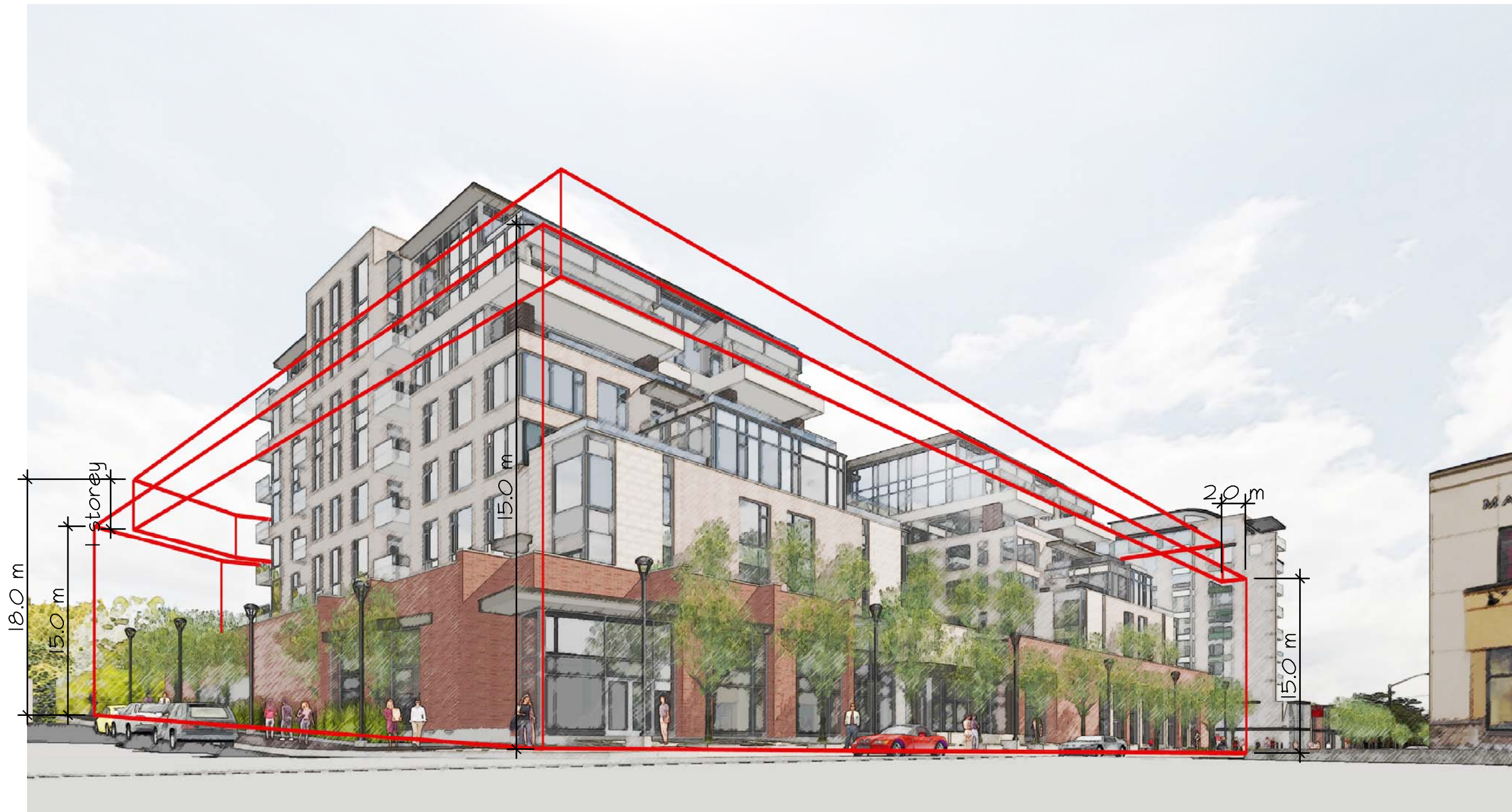
— INDICATES BUILDING ENVELOPE ALLOWABLE UNDER CURRENT ZONING DIMENSIONS ARE FROM AVERAGE GRADE