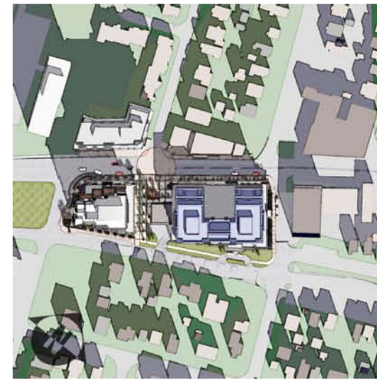
MARCH 21 SEPTEMBER 21 9 AM