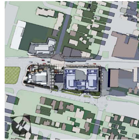
MARCH 21 SEPTEMBER 21 4 PM