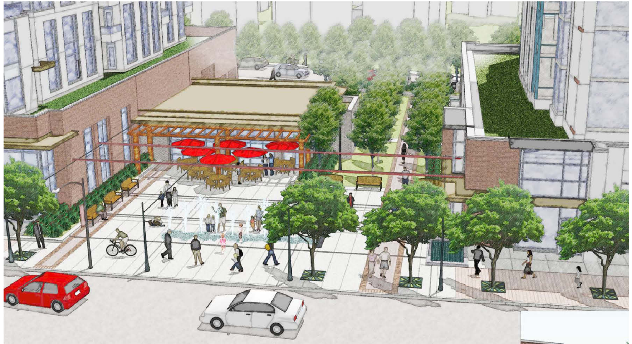
LANDSCAPE DESIGN BY CORUSH SUNDERLAND WRIGHT