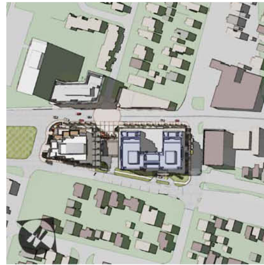
JUNE 21 4 PM